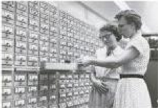
What my parents think I do.