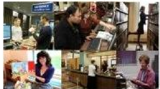
What I actually do.

Mashable.com "What I Really Do: The Best Examples of the Job-Themed Meme"