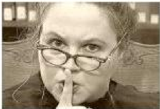
What my patrons think I do.