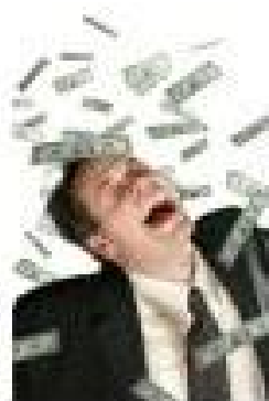
What the taxpayers think I do.